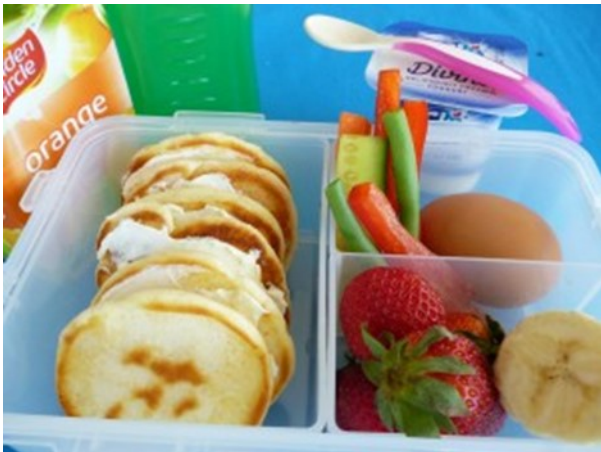
Pikelet lunch with egg and veg